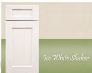
Ice White Shaker